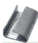
Metal buckles 1608