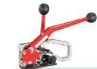
Tensioner sealer H44