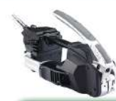
Pneumatic Zapak 28