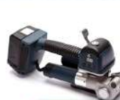
Battery DD 19-25