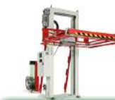
Strapping Machine TP-733 VTS