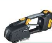
Battery Zapak 97