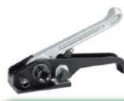
Tensioner PQ 200