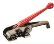
Tensioner MUL 320