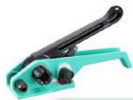
Tensioner H 23