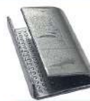
Serrated seals 1610