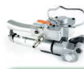
Pneumatic AQD 19-25