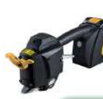
Zapak ZP 25