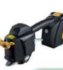
Zapak ZP 25