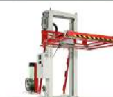
Strapping Machine TP-733 VTS