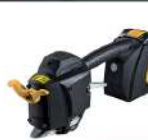
Zapak ZP 25