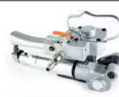
Pneumatic AQD 19-25