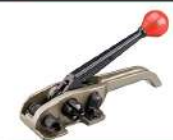
Tensioner PQ 200