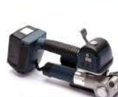
Battery DD 19-25