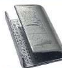
Serrated seals 1610